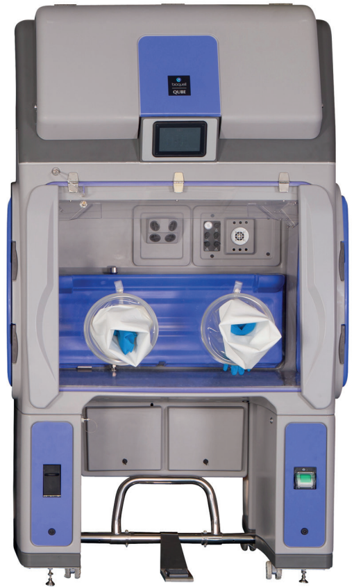
Bioquell Qube - M-1 Single chamber with built-in biodecontamination

“ The Bioquell Qube can be configured for your needs. ”