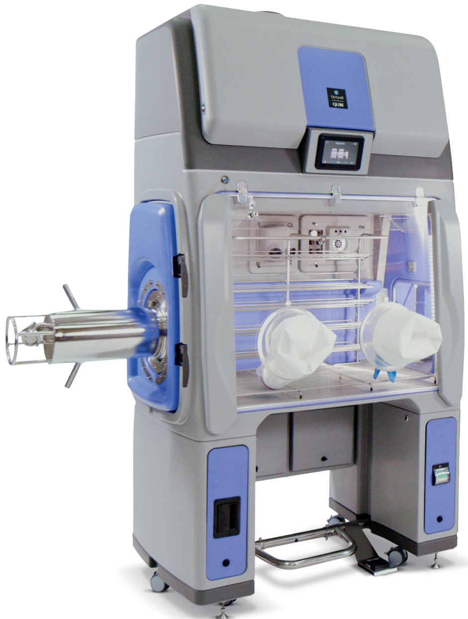
The Bioquell Qube isolator M-1 configuration with integrated Bioquell Hydrogen Peroxide Vapor decontamination technology