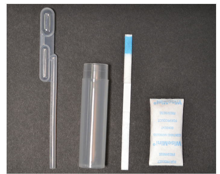
Test kit components (from left to right): volumetric pipette, test vial, test strip, desiccant

Description: Rapid Bio Intelligence Test Kit Part number: RAPIDBIO.88